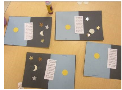
Bible lesson– God made the Sun, moon & stars. Moon phases matching