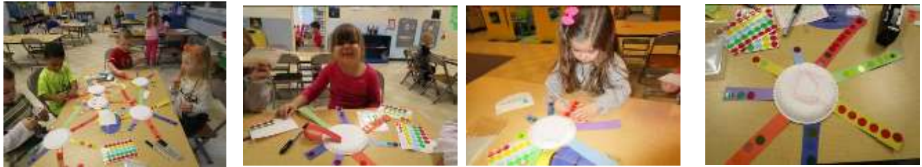
Pre-K was working on an octopus with 1-8 dots on each tentacle.