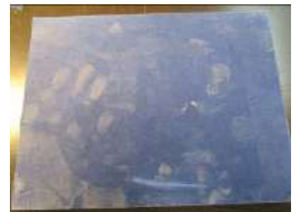
After the water evaporated only crystals were left on the paper from the salt water painting we made the day before.