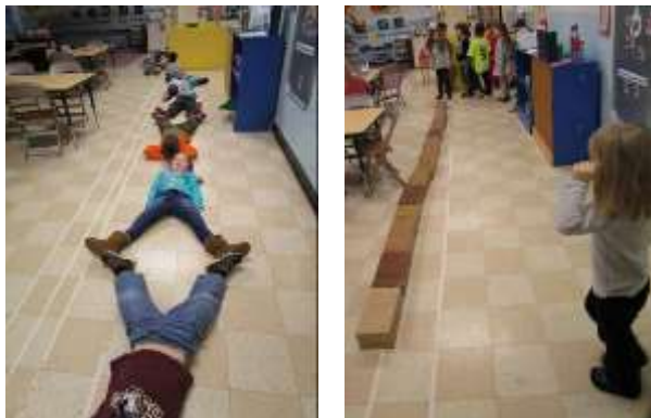
We used children and blocks to measure the Blue Whale, great white shark, giant octopus, dolphin & mackerel.