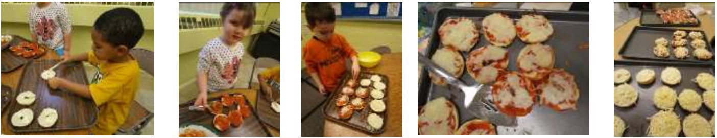
Friends making pizzas for snack, choices of cheese, cheese & sauce or cheese & pepperoni was enjoyed by all the friends.