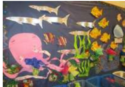
Our completed Ocean mural, filled with yellow tangs, mackerels, clown fish, coral, sea anemones, sea urchins and feather dusters and sting rays.

January was all about numbers also. Counting, measuring, writing, learning patterns and visual recognition were some of the ways we introduced and taught numbers. Pre-k is learning to write 1-10, PS 1-5.