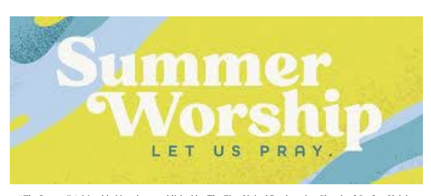
"The Runner" A Monthly Newsletter published by The First United Presbyterian Church of Crafton Heights