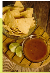
chips & gauc